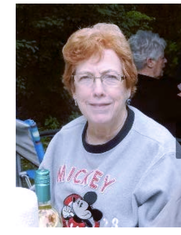
September 8, 2019